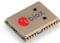
NEO-6T: 12.2 x 16.0 x 2.4 mm