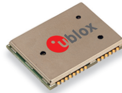
LEA-6T: 17.0 x 22.4 x 2.4 mm